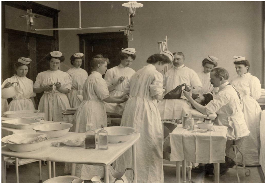
Amasa Wood Hospital Surgical Staff ca. 1905

The repatriated STEGH records are extensive (ca. 6 m. of textual records and graphic material) and present a rich source of information documenting the history of STEGH (opened 1954) and its predecessor institutions the Amasa Wood Hospital, established 1892, and Memorial Hospital, which opened in 1924. The accompanying image, digitized from one of approximately 100 original photographs repatriated with the AO STEGH fonds, presents a staged but nevertheless intriguing glimpse of the Amasa Wood Hospital operating room and surgical staff ca. 1905.