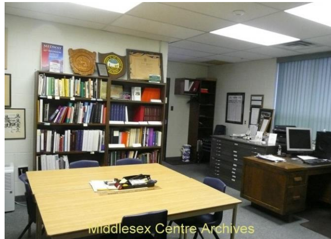
Image of the Middlesex Centre Archives

If you know of someone who is interested in volunteering or who has donations for MCA please contact us at 519-518-5590. The MCA is located at 2652 Gideon Drive, Delaware, ON. For more information please visit our website at www.middlesexcentrearchive.ca or follow us on Twitter at: https://twitter.com/MiddlesexArchiv .